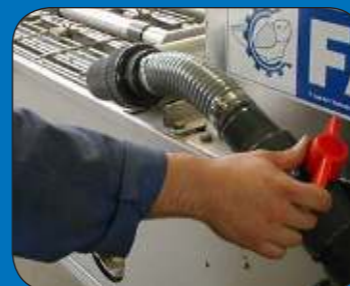
Water supply fully adjustable by valve

Easy to use ! Large touch screen counter display. All informations in only one display : - Number of fish for each counter - Total number of fishes - History of the 5 last counting sessions - Counting time