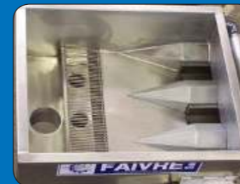
Inside view of the entry hopper with an optional connection for fish pump and water separator.