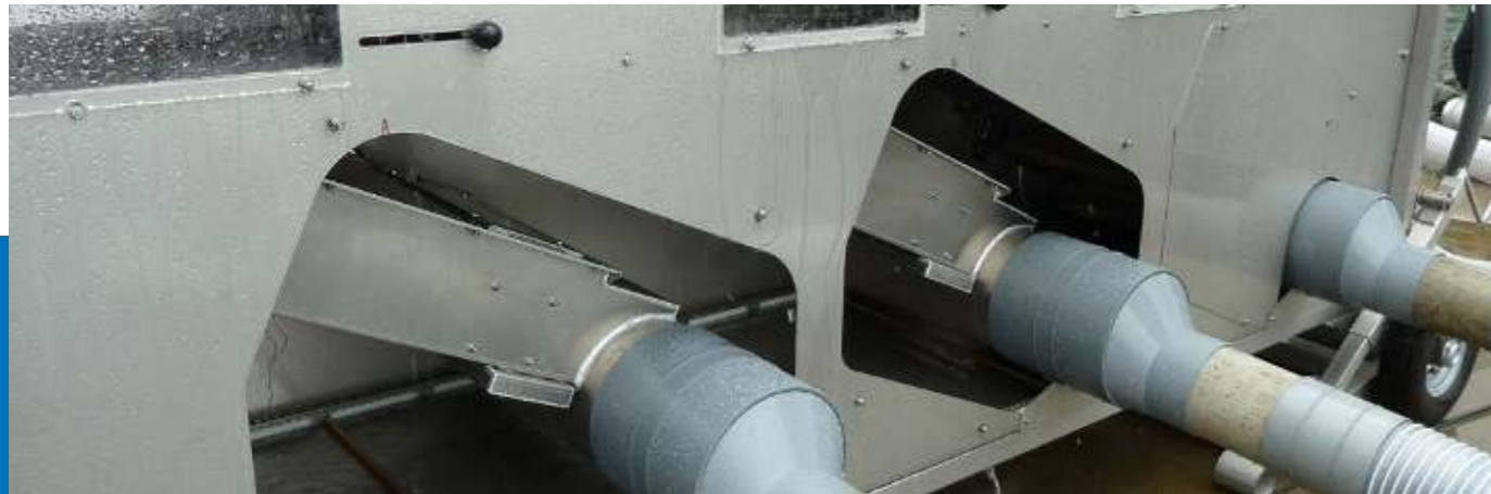
The Pescavision counters located inside the grader are easy to access.