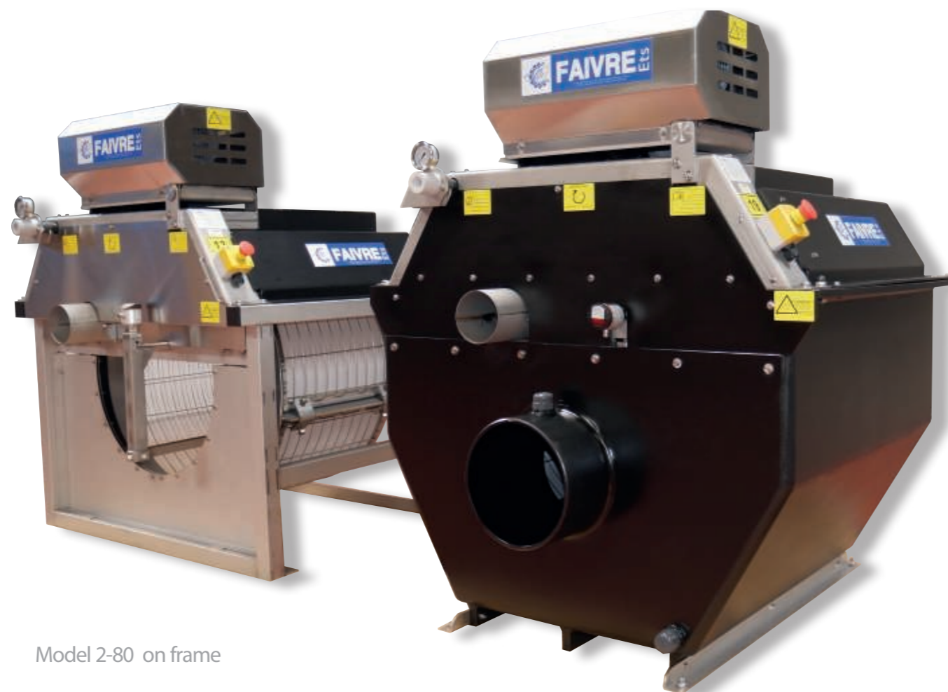
Model 2-80 on frame