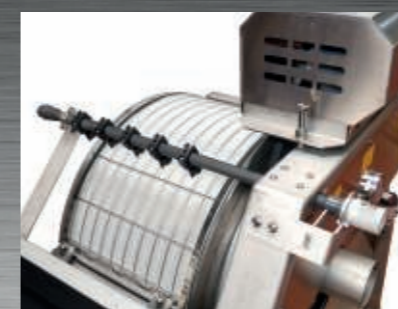
Pvc rinsing ramp with composite T