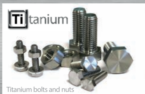
Titanium bolts and nuts