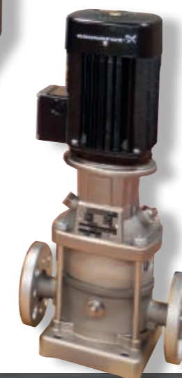
Titanium backwash pump

Polyester mesh with HDPE injected frame as standard