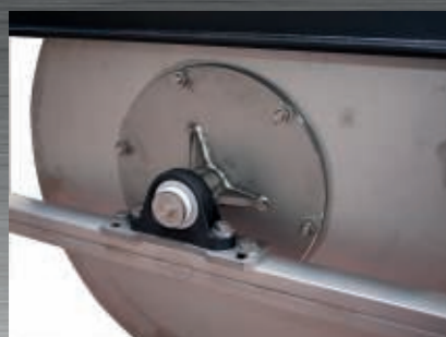
Duplex stainless steel drum shaft and frame and composite bearing