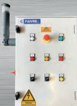
SWITCH BOX : The optional switch box is delivered with 10 meters of cable to connect motor, pump, and level sensor. - IP 65 sealed switch box.