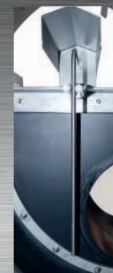
Titanium probe inside the drum