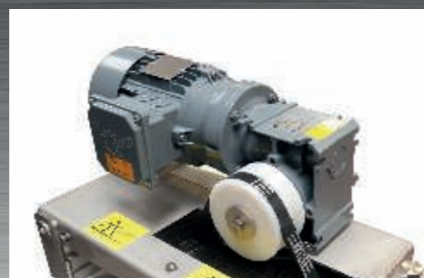
IP 66 gear motor with dip-primed, red-brown and 2 shot polyurethane primer and 2 polyurethane finishing coat